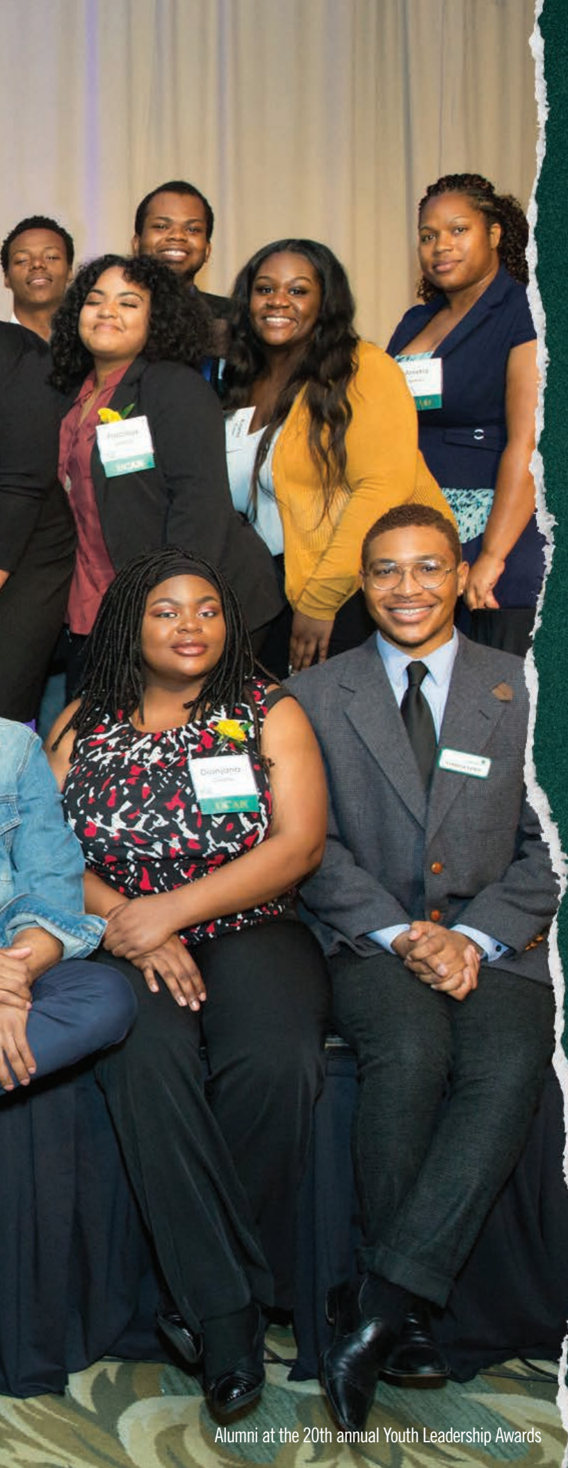
Alumni at the 20th annual Youth Leadership Awards

“Your team becomes your family, our testimonies plant the seed, the dedication becomes our home and the advocacy becomes our life.”